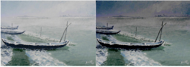
Figure 3. Alfio Cioffi, Il Po bianco (The White Po), 2007, oil on canvas board, 35×50.

A different example is represented by the painting La battaglia di Pavia (Battle of Pavia) by Gherardo Poli (1676–1739), an artist of landscapes in which real elements are transformed in fictitious representations (Figure 4). In this case, the subject is an event that occurred in 1525. After the CNN processing, several hidden details emerge from the fog, demonstrating that fog has been added artificially, even if its effects are carefully reproduced. Furthermore, it can be observed that smoke over Pavia is preserved after the fog removal.