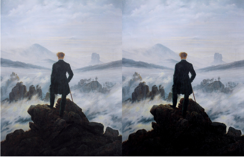
Figure 5. Caspar David Friedrich, Der Wanderer über dem Nebelmeer (Wanderer above the Sea of Fog), oil on canvas, 98×75, Kunsthalle Hamburg.