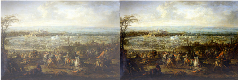
Figure 4. Gherardo Poli, La battaglia di Pavia (Battle of Pavia), oil on canvas, 84×128, Musei Civici di Pavia.

A different example is represented by the painting La battaglia di Pavia (Battle of Pavia) by Gherardo Poli (1676–1739), an artist of landscapes in which real elements are transformed in fictitious representations (Figure 4). In this case, the subject is an event that occurred in 1525. After the CNN processing, several hidden details emerge from the fog, demonstrating that fog has been added artificially, even if its effects are carefully reproduced. Furthermore, it can be observed that smoke over Pavia is preserved after the fog removal.